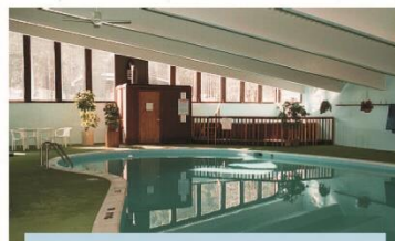
Clubhouse Pool and Waterfall Spa!

Columbine Lake's Association fee is only $73 per month. This keeps the lake stocked with trout, covers road maintenance, snow and trash removal, and keeps the clubhouse open year-round with its indoor pool, sauna, waterfall hot tub, kitchen and games room. Community water ($5000 tap fee) & sewer ($9600 tap fee) are in the road to make building easy.